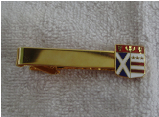
Tie Bar - $5