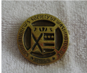
Brass Challenge Coins - $5