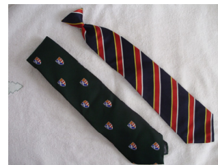
Clip-on ties - $25 Silk Ties - $25