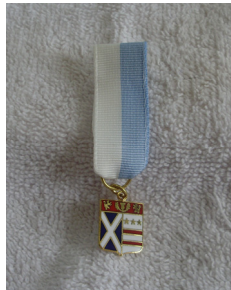
Miniature Medals - $10