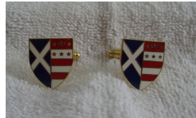
Cuff Links - $5