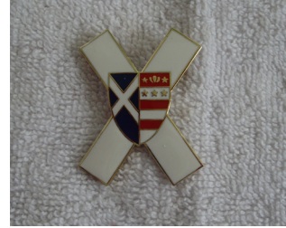
Ladies Companion Pin - $5