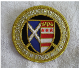
Blazer Badges - $25