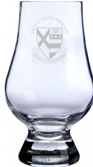
Glencairn scotch glasses-$25